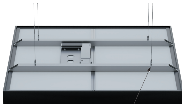
Suspended Mounting shown

*Surface Mount will have an opening of 1.3" (33mm) between the frame and the ceiling